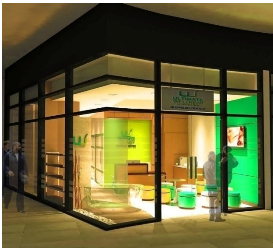
Rendered Perspective for UWC BUSINESS CENTER